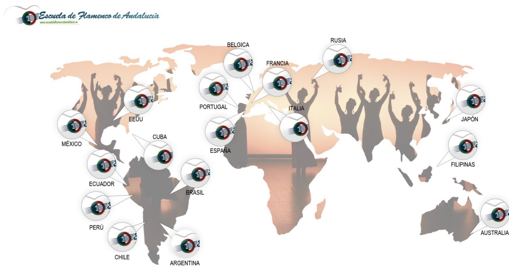
IMPACTO DE LA ESCUELA DE FLAMENCO DE ANDALUCÍA EN ESPAÑA Y EL EXTERIOR.

The number of Headquarters and Delegations is increasing. We actually have presence in more than 50 cities in Spain and in 2019 more than 25 new headquarters from different cities in Spain and the world were incorporated. Up until now we have presence in 17 countries with petitions in more than 15 new countries where new headquarters are intended to be incorporated.